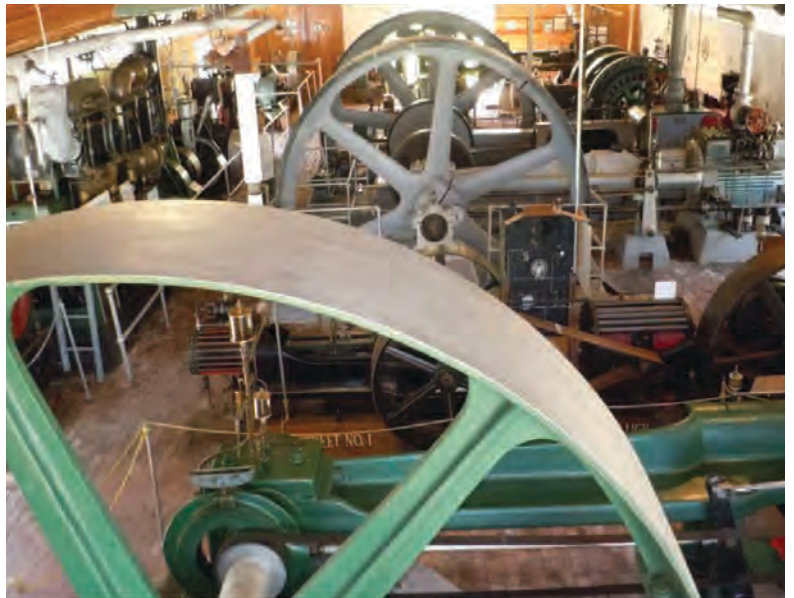
A panoramic view inside the steam engine building with many of the engines that will be running.

ADMISSION: $15 • $7 STUDENTS PLENTY OF FREE PARKING REFRESHMENTS AVAILABLE