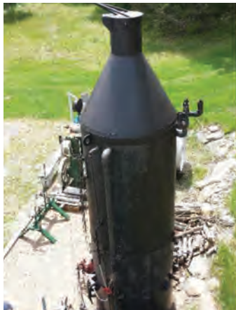
The 100 horse power 'Lookout' boiler will be fired up to run the large engines and the model engines on the steam table.

ADMISSION: $15 • $7 STUDENTS PLENTY OF FREE PARKING REFRESHMENTS AVAILABLE