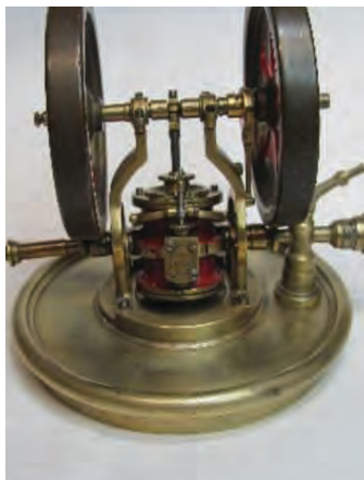
A 1863 model trunnion engine that is 4½" high.

Your ingenious relics and your exquisite models make the show. Steam, gas, diesel, hot air or electric. Engines, intriguing mechanical devices, antique autos & motorcycles, boats, steam bicycles. Help make this a dynamic display.